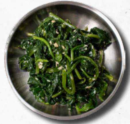
Sigeumchi Namul 시금치나물 ✓ ae,i würziger Spinatsalat seasoned spinach salad