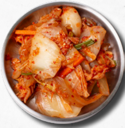
Kimchi 김치 ✓ ei scharf eingelegter Chinakohl spicy fermented napa cabbage