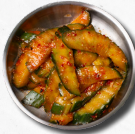
Oi Muchim 오이무침 ✓ ae,i scharfer Gurkensalat spicy cucumber salad