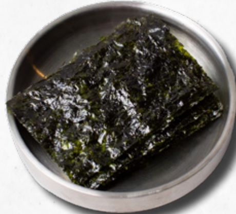
Gim Gui 김구이 ✓ ae,i

콩나물무침 ✓ ae,i würziger Sojasprossensalat seasoned soybean sprout salad